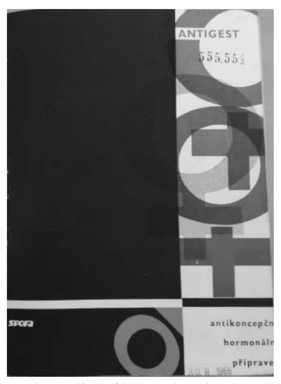
Fig. 1 and 2: Cover and first page of the "Antigest, antikoncepční hormonální přípravek" [Antigest, Contraceptive Hormonal Medication], published by Spojené podniky pro zdravotnickou výrobu [United enterprise for Pharmaceutical Production, SPOFA], Odborná informační služba [Public Relation Department]. Praha 1966. This brochure was to be displayed in waiting rooms of physicians and to inform women about the new hormonal form of contraception.